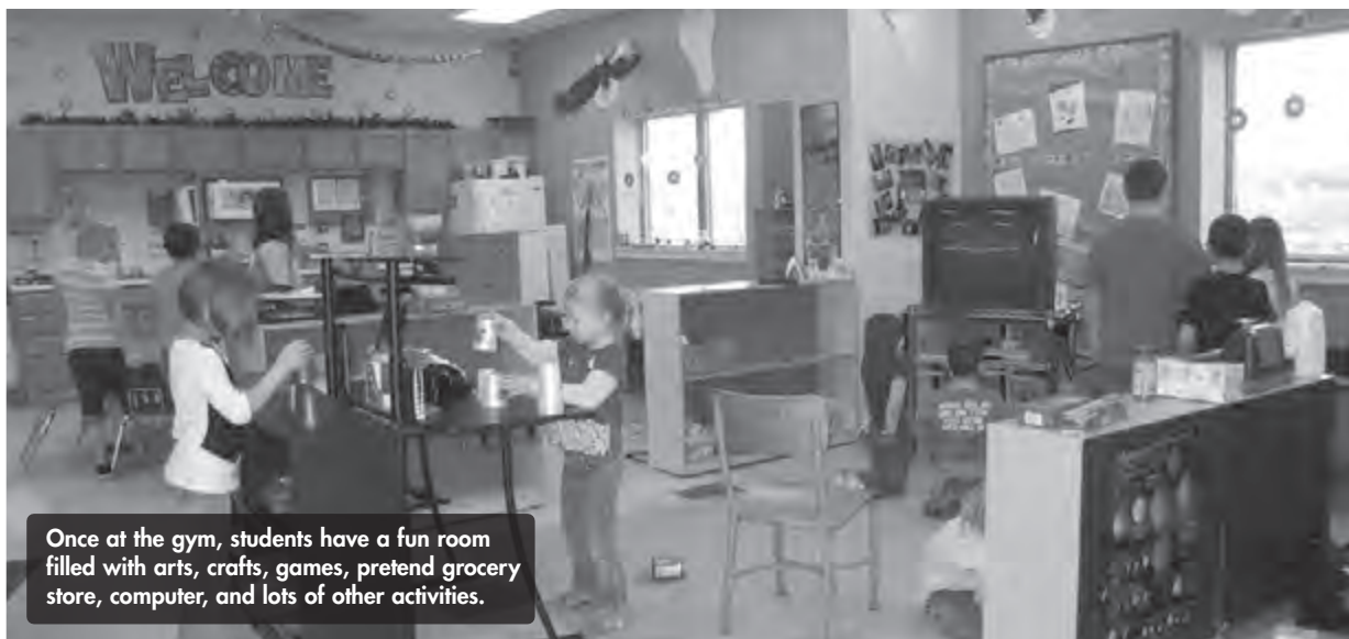
Once at the gym, students have a fun room filled with arts, crafts, games, pretend grocery store, computer, and lots of other activities.